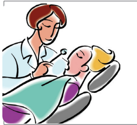
Family receives dental treatment