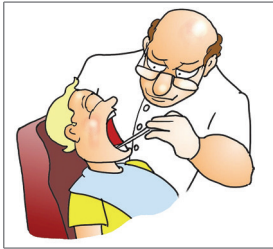
Regular dental visits for child