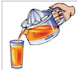
Less or no juice