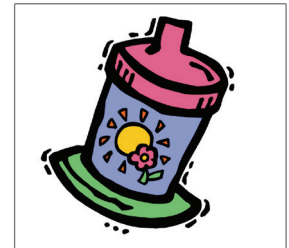
Only water or milk in sippy cups