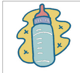
Wean off bottle (no bottles for sleeping)