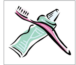
Brush with fluoride toothpaste at least 2 times daily