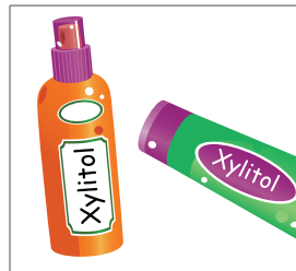
Use xylitol spray, gel or dissolving tablets

IMPORTANT: The last thing that touches your child's teeth before bedtime is the toothbrush with fluoride toothpaste.