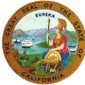
EDMUND G. BROWN JR.