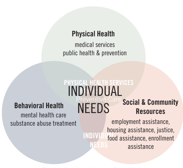
Exhibit 3. Whole-Person Care Model

Exhibit 3 depicts the numerous public services and systems that individuals in the safety net might interact with, including physical health (e.g., primary care, specialty care, hospitals), mental health, substance use treatment services, criminal justice, public health, and social services. Social services can include eligibility for Medicaid and other public programs such as the Supplemental Nutrition Assistance Program (SNAP/CalFresh), Women, Infants, and Children (WIC), or general relief assistance. It can also include direct services, such as housing, foster care, and employment assistance. The degree to which these various systems are communicating and coordinating with one another at the system level represents one aspect of how whole-person care is operationalized at the patient level.