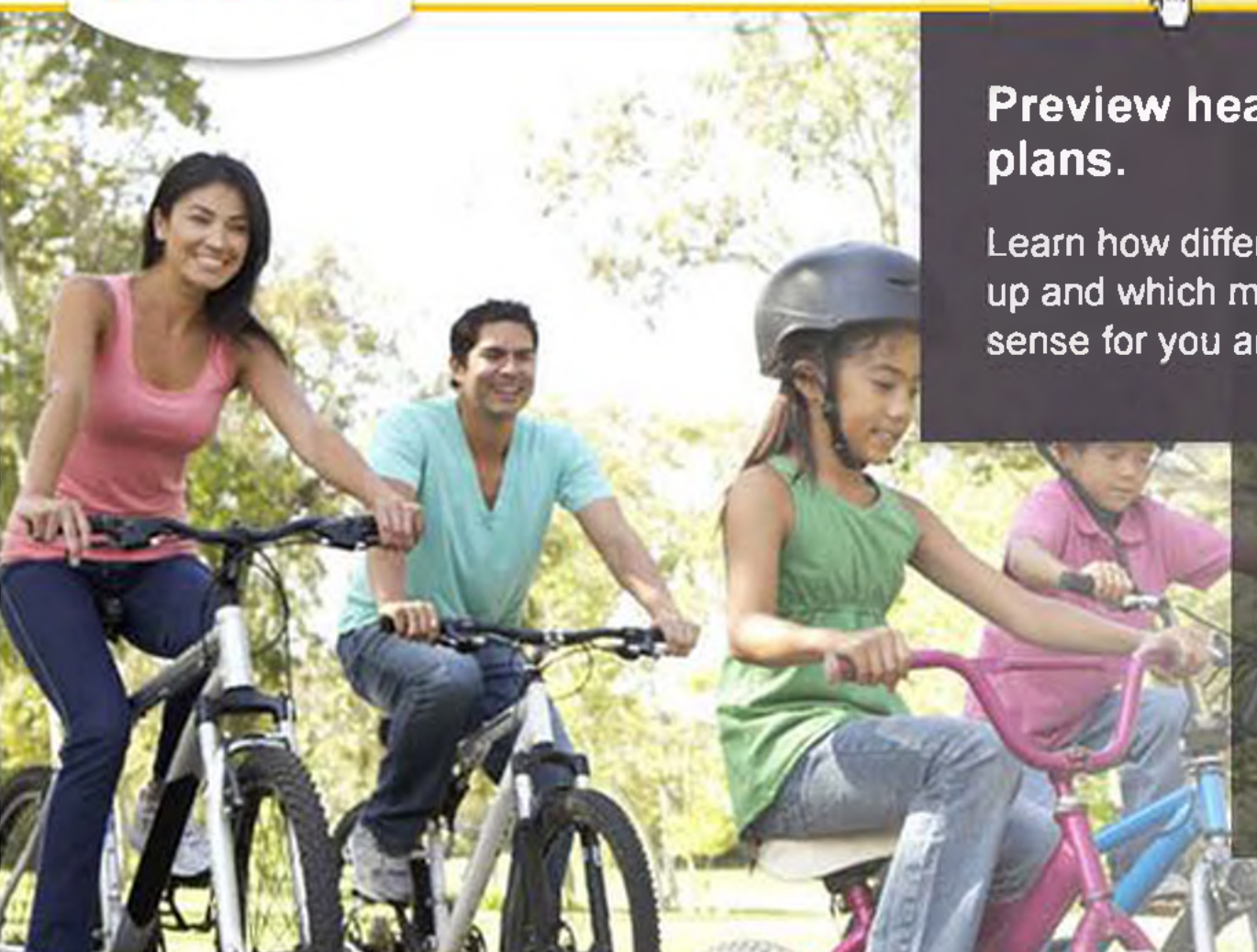
GET HELP Find Answers