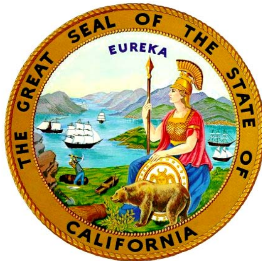
The Great Seal