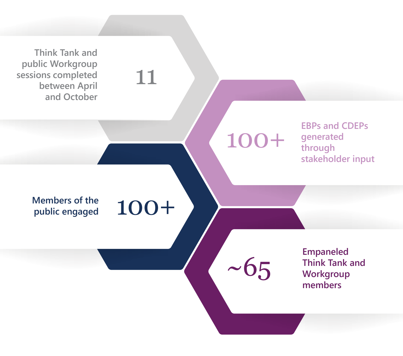
Figure 1: Summary of Stakeholder Engagement through October 2022

In developing multiple facets of the EBP/CDEP workstream, DHCS employed a multipronged stakeholder-driven approach.