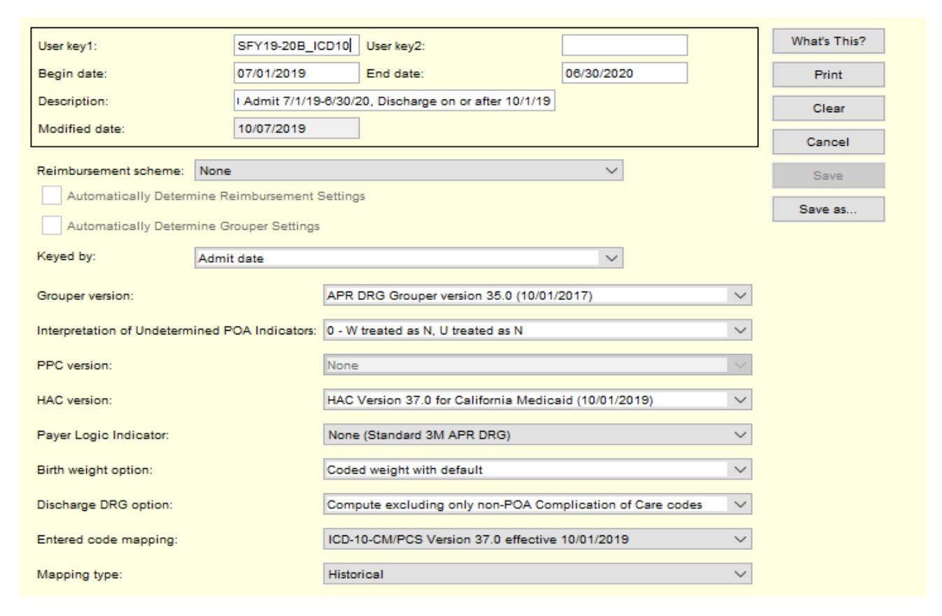
Figure 2: ICD10 admit 7/1/19-6/30/20, discharge after 10/1/19