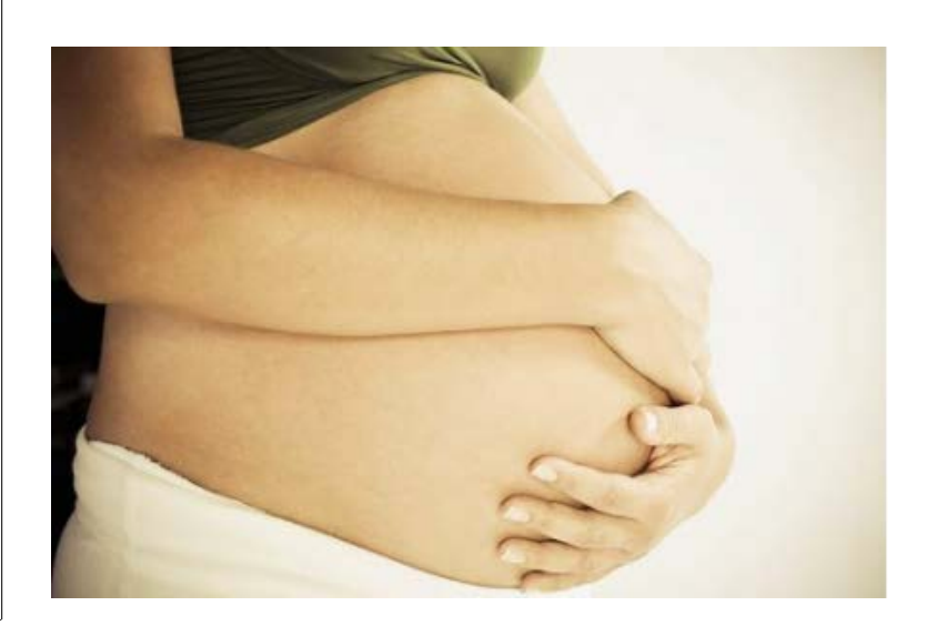
Why are more American women dying after childbirth?