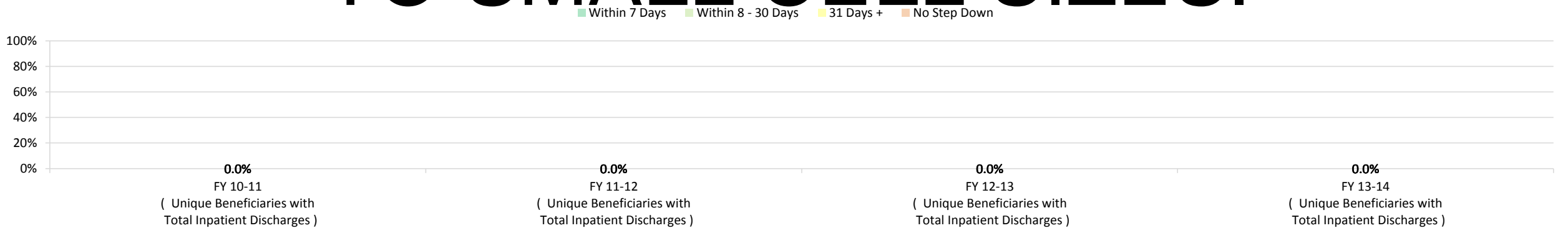
Percentage of Discharges by Time Between Inpatient Discharge and Step Down Service

TABLES AND CHARTS NOT PRODUCED FOR THIS INDICATOR DUE TO SMALL CELL SIZES.