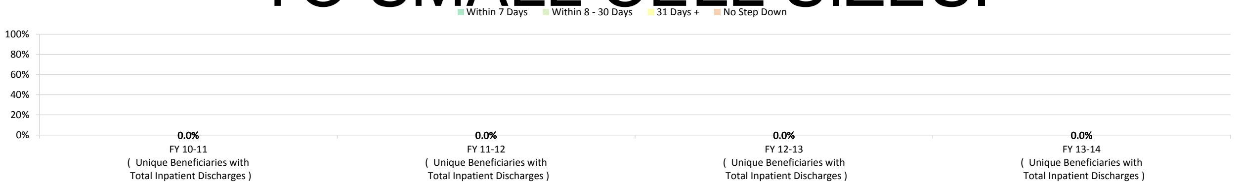
Percentage of Discharges by Time Between Inpatient Discharge and Step Down Service

TABLES AND CHARTS NOT PRODUCED FOR THIS INDICATOR DUE TO SMALL CELL SIZES.