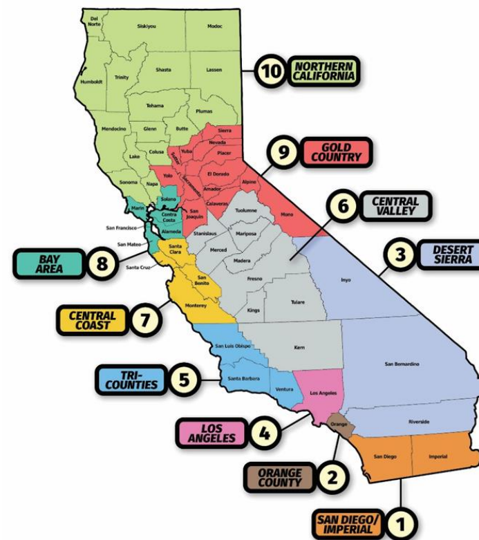
Every Woman Counts Regional Map