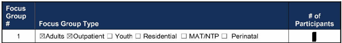
Table D: Summary of Plan Member/Family Focus Groups

*Medication assisted treatment (MAT), Narcotic Treatment Program (NTP)