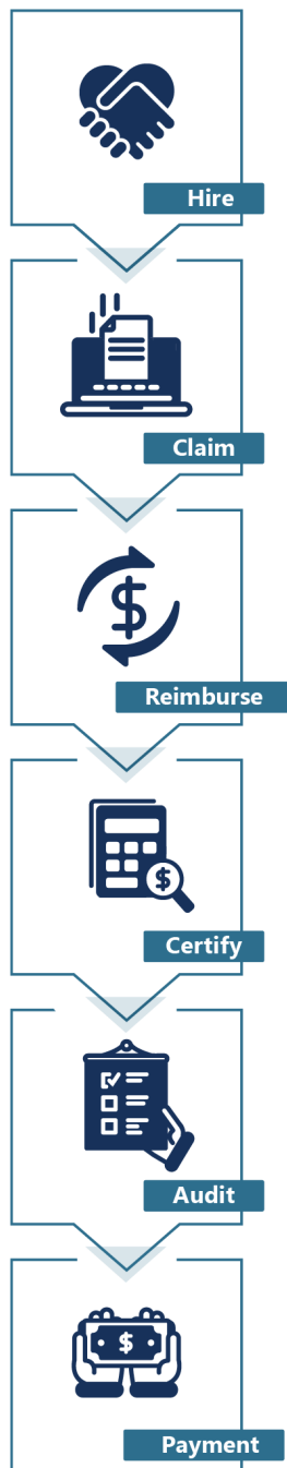
Figure 1. LEA BOP Reimbursement Process